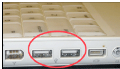
USB Plug - on an iBook